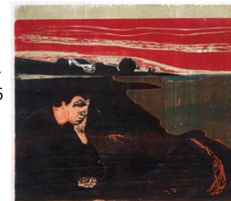
Melancholy Munch 1896