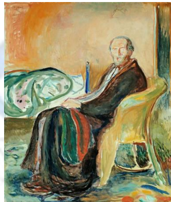
Self portrait Edvard Munch 1919