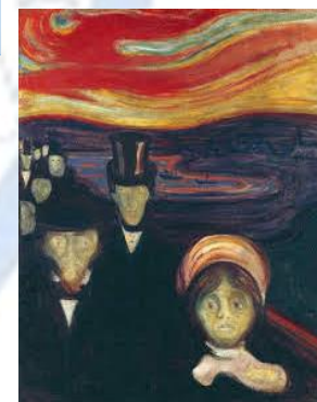
Anxiety Munch 1894