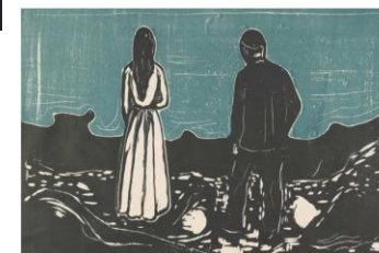
Two Human Beings, the Lonely Ones Munch 1896