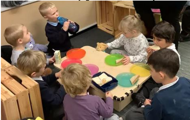
so many parents came to join us to play games and eat delicious food!

EYFS Teddy Bears Picnic on the last day of half term, Robin and Wren Classes held a teddy bears picnic – they had to stay inside as the weather was not very good. It was lovely that