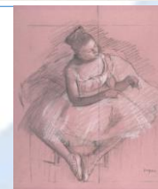
Odilon Redon (1896)