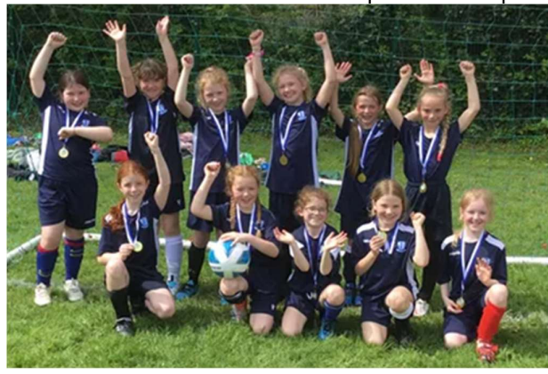
Year 3/4 Football on 19<sup>th</sup> May a Year 3 & 4 mixed team represented St White's at the ProStars football tournament. After a very close competition which went all the way to penalties we won! Brilliant work team, and well worth the

Girls Football on 5<sup>th</sup> May our Year 3 & 4 girls entered the first Prostars tournament at Tutshill Primary School. They won all their fixtures and scored lots of goals. We are really proud of their achievement and their excellent sportsmanship!