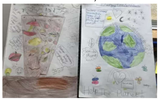
Skylark Class made a display of their PSHE work of which we are very proud.