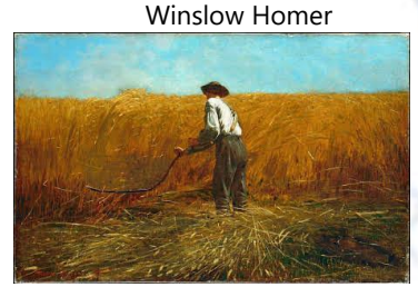
The Veteran In a New Field (1865)