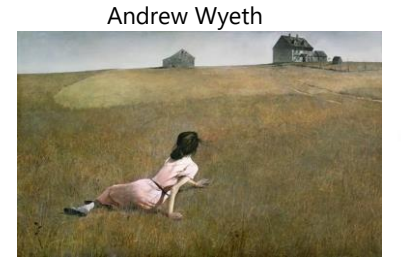
Christina's World (1948)