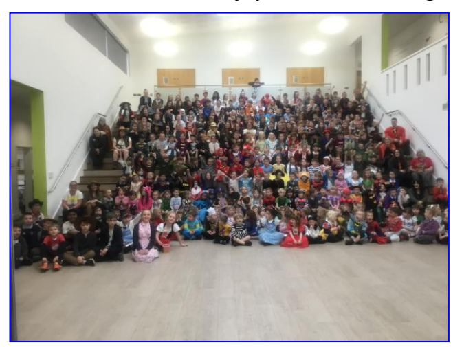
activities based on the book 'The Journey' by Aaron Becker

World Book Day - The whole school celebrated 'World Book Day' by being dressed ready for an adventure! They all looked fantastic and enjoyed some amazing