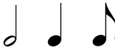
Minim Crotchet Quaver

We are musicians. We use music to express ourselves, to communicate and to entertain ourselves and others.