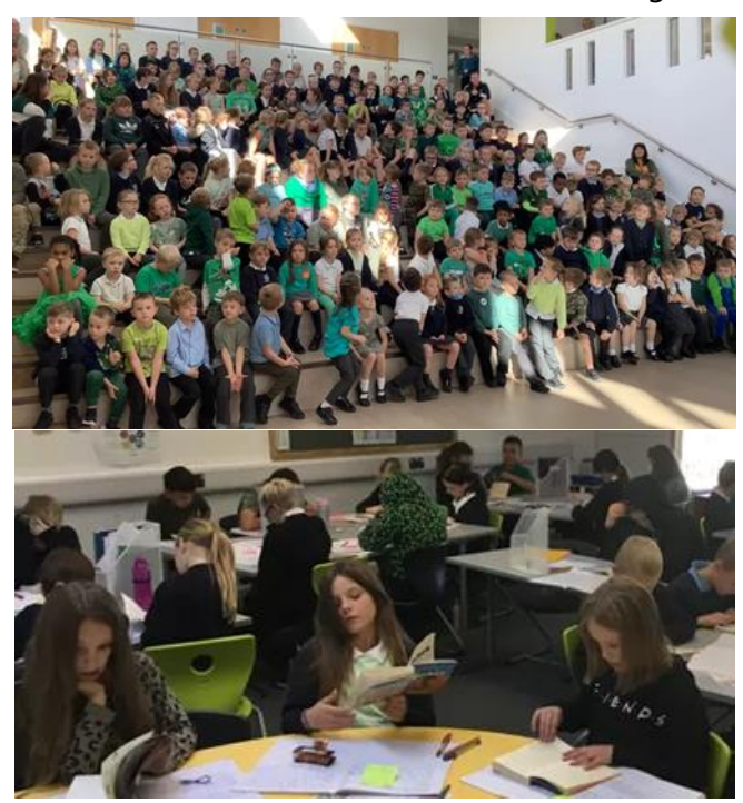
your mental health and tips on good mental health, followed by reading for 10 minutes and

Wear green for mental health day – thanks to all the children who wore something green and to everyone who donated – we raised an amazing £96.00 for the mental health charity MIND. During the day the children all watched an online event about the benefits of reading for